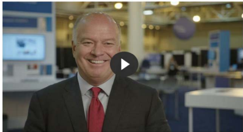
Take a look at this InvestmentNews video to learn how EIOC is preparing young talent for the wealth and asset management industry